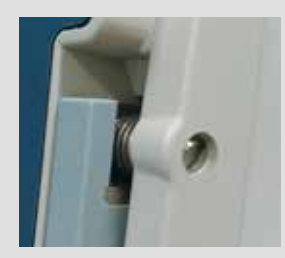
Figure 3: Properly installed (recessed) pivot latch screw